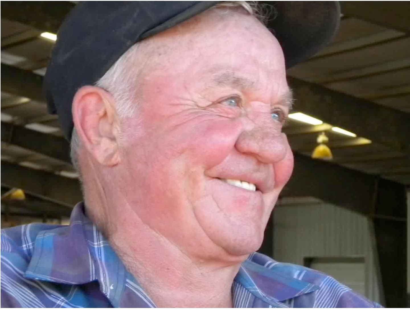
August 26, 2017**9AM